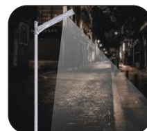
Light dims when there is no one within the range