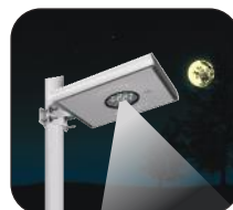
Auto-on and lights up at night