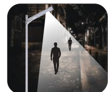
Light brightens up when someone is within the range