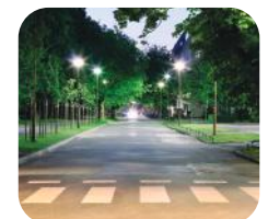
Street & Road