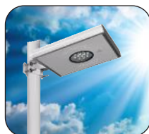
Auto-off for daylight charging