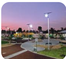
Public Areas & Parks