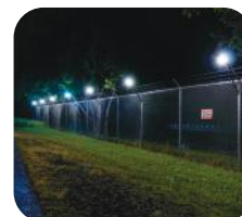
Security & Perimeter